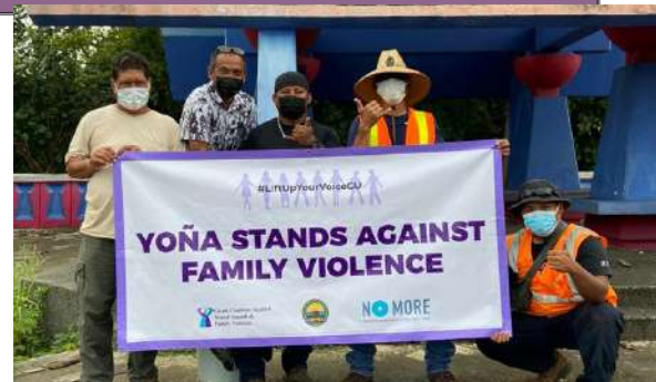
2020 FVAM "Waves in the Villages"

GCASAFV with community members and partners will further efforts to raise awareness about the issue of family violence on our island with its "Waves in the Villages" on Wednesday, October 20, 2021, showtime is at 4:30 PM ChST, and wave time is at 5:00 PM ChST to no later than 6:00 PM ChST. This event will be held in Yigo, Dededo, Tamuning, Barrigada, Mangilao, Hagatna, Yona, and Piti.