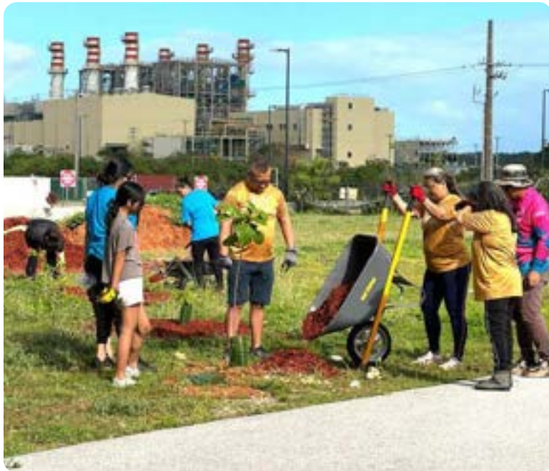
GCASAFV and community volunteers gathered mulch/soil to place onto the plants to prevent overgrowth of weeds.