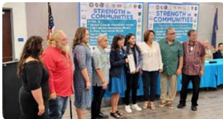
Speaker Therese Terlaje and senators from the 37th Guam Legislature presented a Legislative Resolution to GCASAFV and partners.