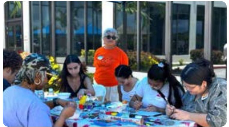
An arts & crafts station provided a creative outlet for those who attended,