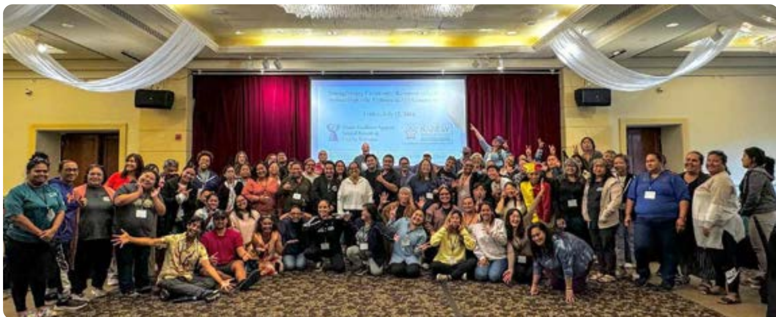
Attendees who participated in last day's training posed after engaging in wellness exercises focused on self-expression, healing, and balance.