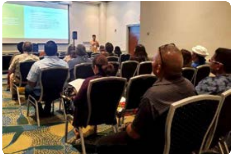
Attendees participated in a breakout session centered on the Inetnon Yo’ãmtë Hatdin Hinemlo (Healing Garden).