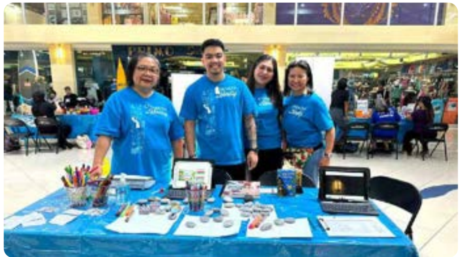
GCASAFV engaged the community by designing river rocks for the Inetnon Yo'ânte Project's pathway to health.

On April 27th, GCASAFV hosted a community outreach event at the Agana Shopping Center in recognition of Sexual Assault Awareness Month, Child Abuse Prevention Month, Autism Awareness Month, Month of the Military Child, Month of the Young Child, Youth Month, and National Crime Victims' Rights Week. Twenty-six coalition member and partner organizations showcased their services, resources, and programs aimed at supporting individuals and families. The outreach event emphasized the importance of building a supportive and informed community to address critical issues affecting the island.