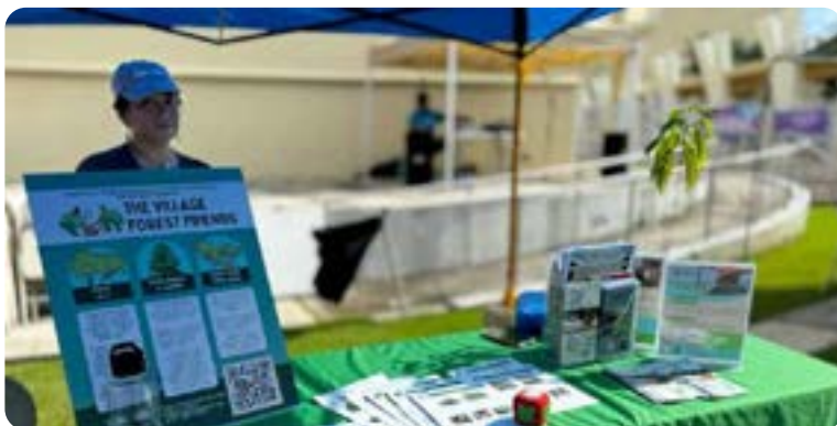
The Department of Agriculture’s Forestry Program provides information regarding Guam’s vegetative environment and how the community can come together to promote sustainability of natural resources.