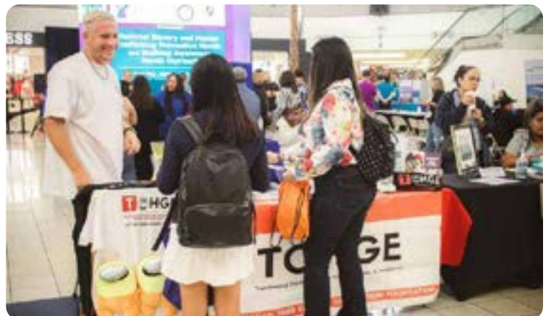
TOHGE (Transforming Ourselves through Healing, Growth & Enrichment) is Guam's only peer-run recovery organization for those struggling with mental health and/or substance abuse.