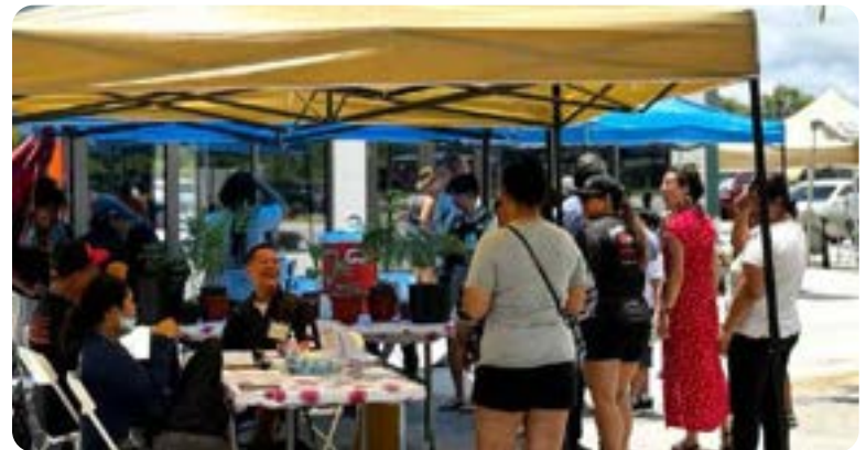
The Family Wellness Day was held at the Medical Arts Center. Attendees learned about traditional medicine and had the opportunity to receive healing.