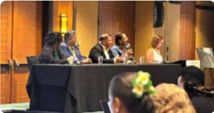
Representatives from the Department of Youth Affairs, Public Defender Services Corporation, Judiciary of Guam, and the Office of Homelessness and Poverty Prevention participated in a panel discussion to answer questions.

On November 15th, GCASAFV supported the Guam Human Rights Initiative's conference, "Poverty in Guam & the Pacific Islands," that shed a light on the critical issue of poverty and brought together experts from various fields to discuss, educate, and foster collaboration on solutions. The event featured keynote addresses, panel discussions, and breakout sessions covering topics such as economic development and job creation, educational opportunities and training, healthcare access and nutrition, and addressing housing instability and homelessness.