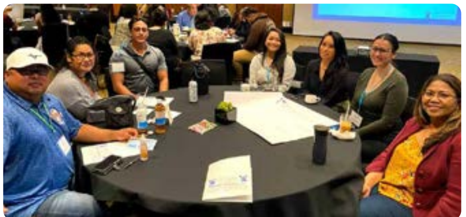
Individuals from the Guam Department of Education (GDOE) and the Guam Army National Guard participated in roundtable discussions.

During the conference, attendees participated in roundtable discussions reflecting on these statements: I am here because I care about, prevention in my community means, and how we can bridge the network of resources across the nation/region. These discussions were instrumental in gathering insight from coalition members and community partners.