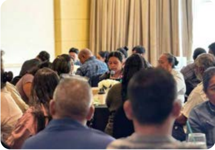
Attendees participated in the conference discussions regarding API communities and healing.