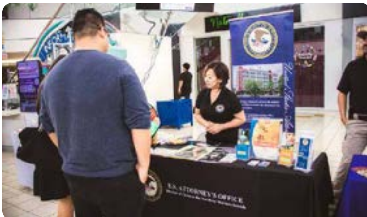
The U.S. Attorney's Office for the Districts of Guam and the Northern Mariana Islands provided information on various resources such as Project Safe Childhood and Project Safe Neighborhoods.