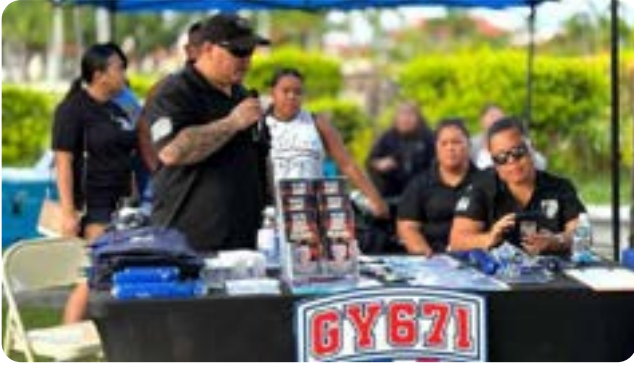
Got Your 671 is a non-profit organization dedicated to helping veteran's and their families regain self-confidence, support, and well-being both mentally and physically.