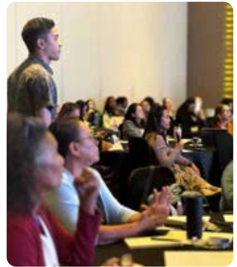
Attendees at the conference engaged in breakout session presentations.