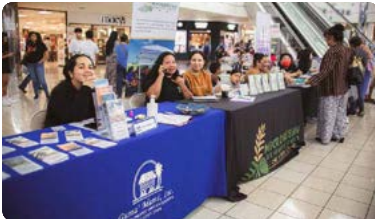
Guam Coalition member Guma' Mami, Inc. provides support and services to individuals with disabilities such as group homes, transitional housing, and educational support groups. The Micronesian Resource Center One Stop Shop, a special project of Mañe'lu, provides informational and educational resources to individuals and families migrating to Guam.