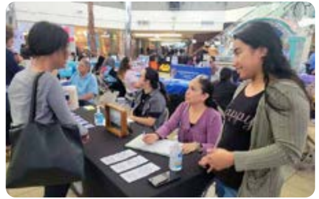
Public Defender Services Corporation Civil Law Center provides no-cost legal advice and services to victims and survivors of domestic violence, dating violence, sexual assault, or stalking.