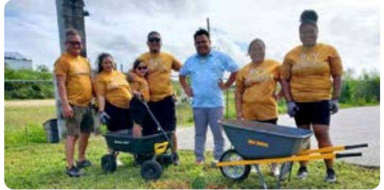
GCASAFV and community volunteers gathered to assess plants.

GCASAFV held its second “Just Planting Day” event in June. The core team of volunteers focused on assessing the areas around each sapling to see if there was anything impacting the plant’s growth. Thank you to all the volunteers who participated in our Inetnon Yo'ámte Project!