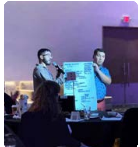
Attendees at the conference participate in roundtable discussions addressing child exposure to violence and disaster planning for survivors of sexual assault and domestic violence.