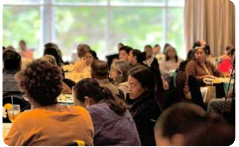
Over 100 individuals attended the four-day conference.