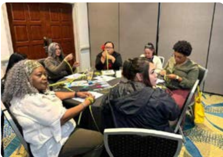
In a breakout session centered on cultural traditions, attendees learned the art of weaving with coconut leaves, embracing a hands-on connection to heritage and creativity.