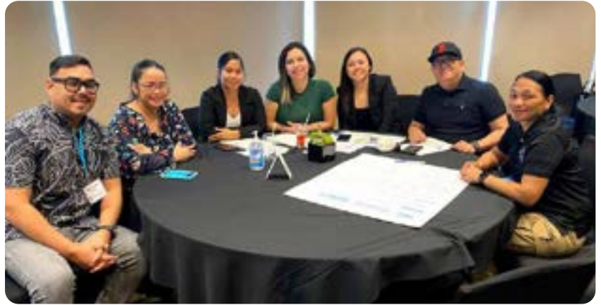
Individuals from New Beginnings and the Guam Police Department participated in roundtable discussions.