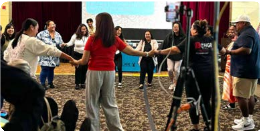
Attendees engaged in a "label" exercise where they come together to explore movement without any boundaries or "labels."