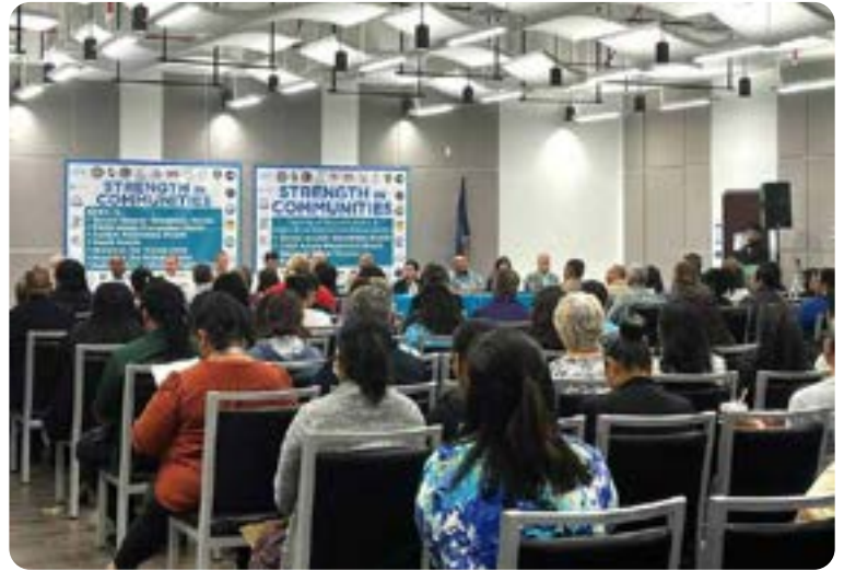
Nearly 200 individuals attended the Signing of Proclamations and Presentation of the Legislative Resolution for the April events.