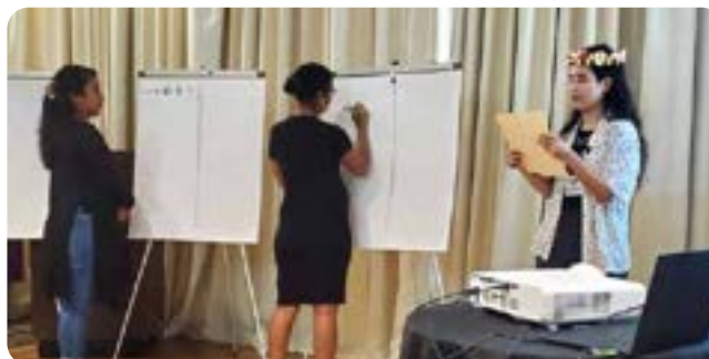
Participants in the training session worked on developing symbols and note-taking techniques when interpreting and translating.