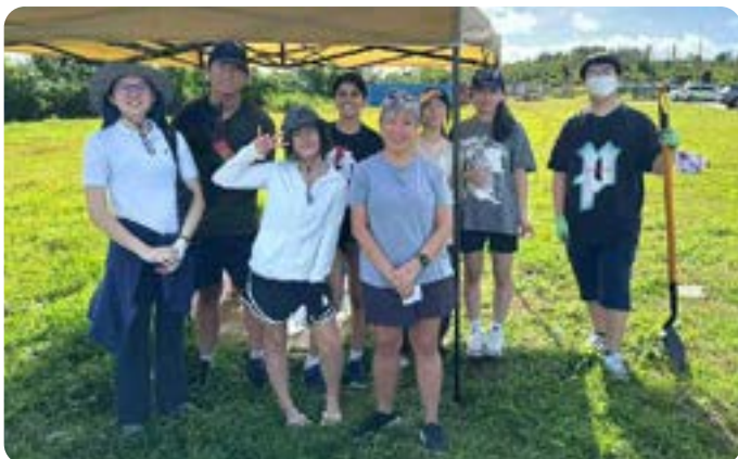
High school students volunteered to take part in the planting process of the Healing Garden.