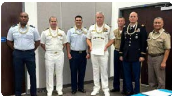
Military leaders signed a Military Proclamation declaring April as Sexual Assault Awareness Month.

April was also recognized as: Autism Awareness Month, Youth Month, Month of the Young Child, and Month of the Military Child.