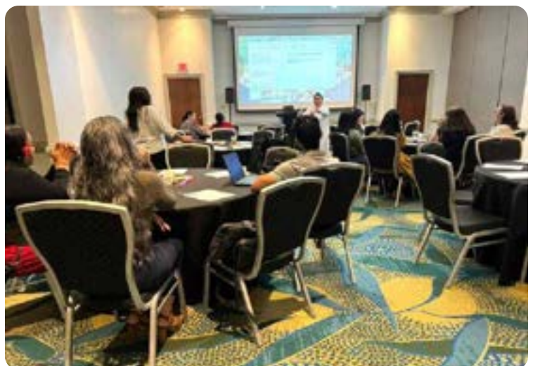
Attendees learned about current trends and events surrounding sexual violence, gaining insight into the evolving challenges and issues impacting communities