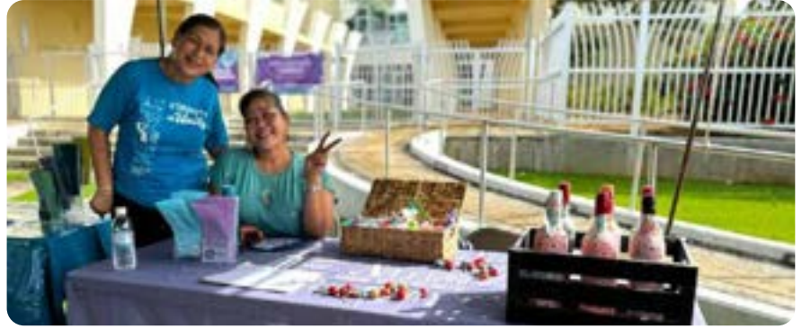
Alee Shelter which provides emergency shelter to both children ages birth to 17 and for women, with or without children, who are in crisis from family domestic violence and sexual assault.