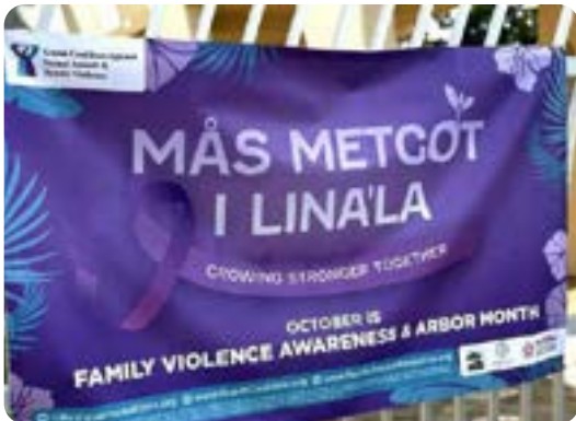
This year’s theme for Family Violence Awareness Month was “Mås Metgot I Lina'la” which translates to “Growing Stronger Together.”

foster healthy people, healthy communities, and healthy environments, while incorporating the cultural healing benefits of local plants on island. Community members had the opportunity to meet our partners to learn of their resources through educational talk story sessions and engage with local community healers. During the event, individuals had the opportunity to discover how endemic trees and plants connect to our cultural heritage while nurturing our environment.