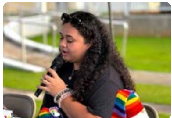
Guam Alternative Lifestyle Association (GALA) presents on the resources they provide to strengthen the quality of life for gay, lesbian, bisexual, transgender, queer, and intersex persons through support, education, and advocacy.