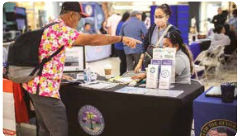
The Public Defender Services Corporation's Civil Law Center presented information on services they provide such as no-cost legal advice and services to those experiencing domestic violence, dating violence, sexual assault, or stalking.