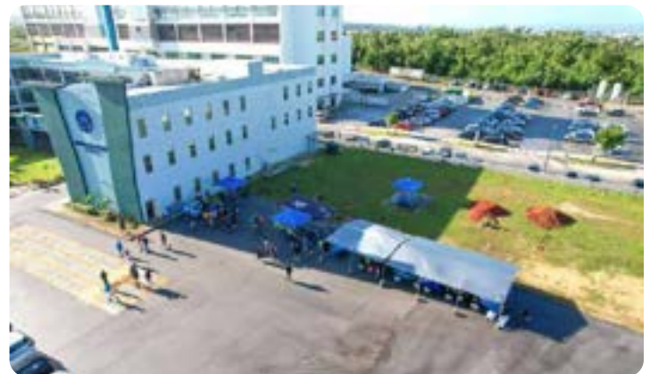
Overview of the Medical Arts Center, where the Healing Garden is located. The healing garden encompasses 3 acres of the Medical Arts Center property.

The Inetnon Yo'ámte Project was funded by the Fina'maolek Grant Program of the Guam Department of Agriculture (DOAG) Forestry and Soil Resources Division, Urban and Community Forestry Program and the USDA Forest Service. The Inetnon Yo'ámte core project team included NAPIESV, TOGHE Inc., Nicolette Baldovino Community Foundation, and CW Holdings. GCASAFV also appreciates the DOAG assistance with providing 123 of the 148 trees and shrubs that were planted, and the continued support of CW Holdings for installing water sprinklers and the continuous maintenance of the grounds to allow the plants to thrive. Consistent with the objective related to the health and well-being connection to trees and the environment, the Project also thrived thanks to the core project team partners who were essential to developing the Project's Hatdin Hinemlo (healing garden).