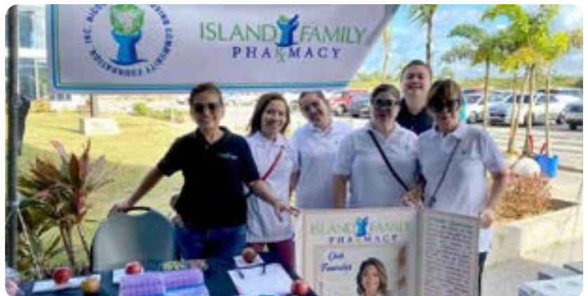
Nicolette Baldovino Community Foundation was a key partner in the Inetnon Yo'ámte Hatdin Hinemlo Project.