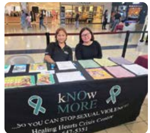
The Family Violence Awareness Month Outreach was held at the Micronesia Mall Center Court. Entertainment by Talent Box kept the event lively!