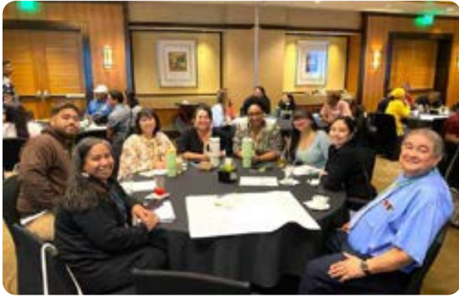
Individuals from Mañe'lu, Guam Legal Services Corporation - Disability Law Center, and WestCare Pacific Islands participated in roundtable discussions.